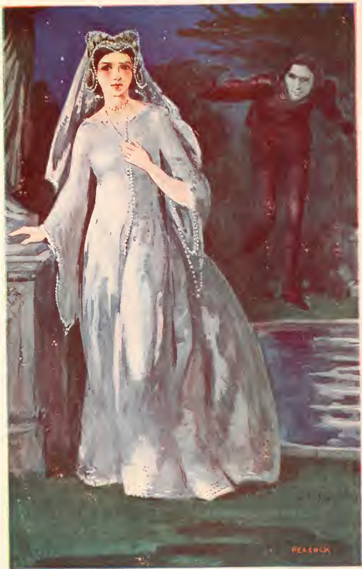
THE VALE OF CEDARS.